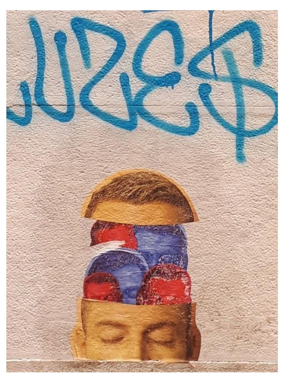
street art in valencia by unknown artist, February 2023