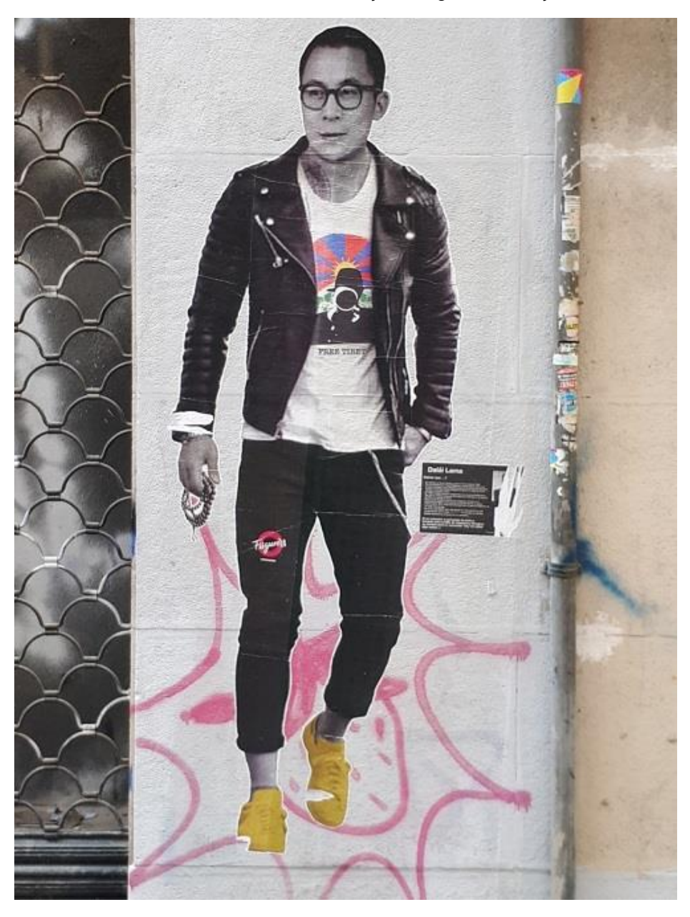
street art in valencia by unknown artist, February 2023

In a first point we present the testing conducted in the 3 countries; in a second point a selection of "best practices" or initiatives carried out on a national, European or International level to enhance diversity through creativity.