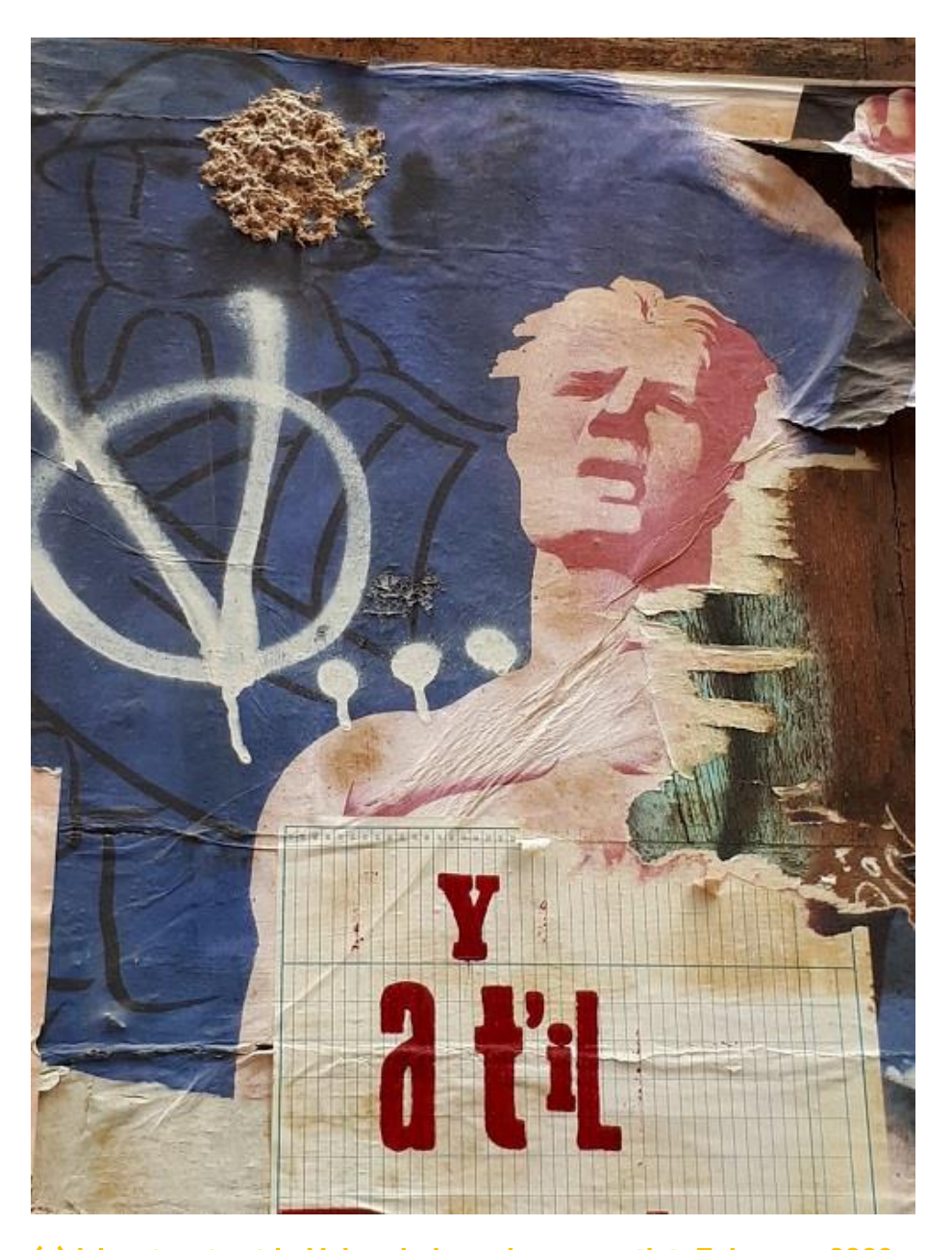
street art in Valencia by unknown artist, February 2023