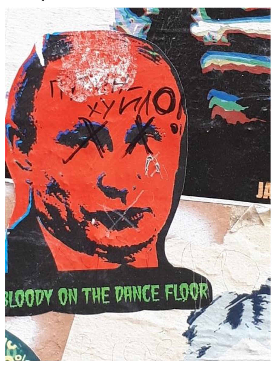
street art in Valencia by unknown artist, February 2023

This two-year project was challenging in many ways. Firstly, because the call for proposal was published by the European Commission in September 2020 after 8 months of a pandemic (Covid) that has caused a major turmoil in Europe, Italy being the first and more affected country. Anyway, all the EU countries suffered for human, social and economic reasons. We couldn't anticipate that a second main turmoil would happen in the beginning of 2022 with the war back on the European soil- Ukraine being attacked by Russia in February 2022. This has even more emphasized the need for being prepared to a major turmoil for the years to come in Europe and worldwide. In a first point we will remind the main milestones of the Think Diverse- from the designing of the creative sets to the writing of the handbook. In a second point we will suggest some key points for the future of the Think Diverse on a national and European level. In a last point we will emphasize the main importance of our work to face disturbing and troubled times worldwide.