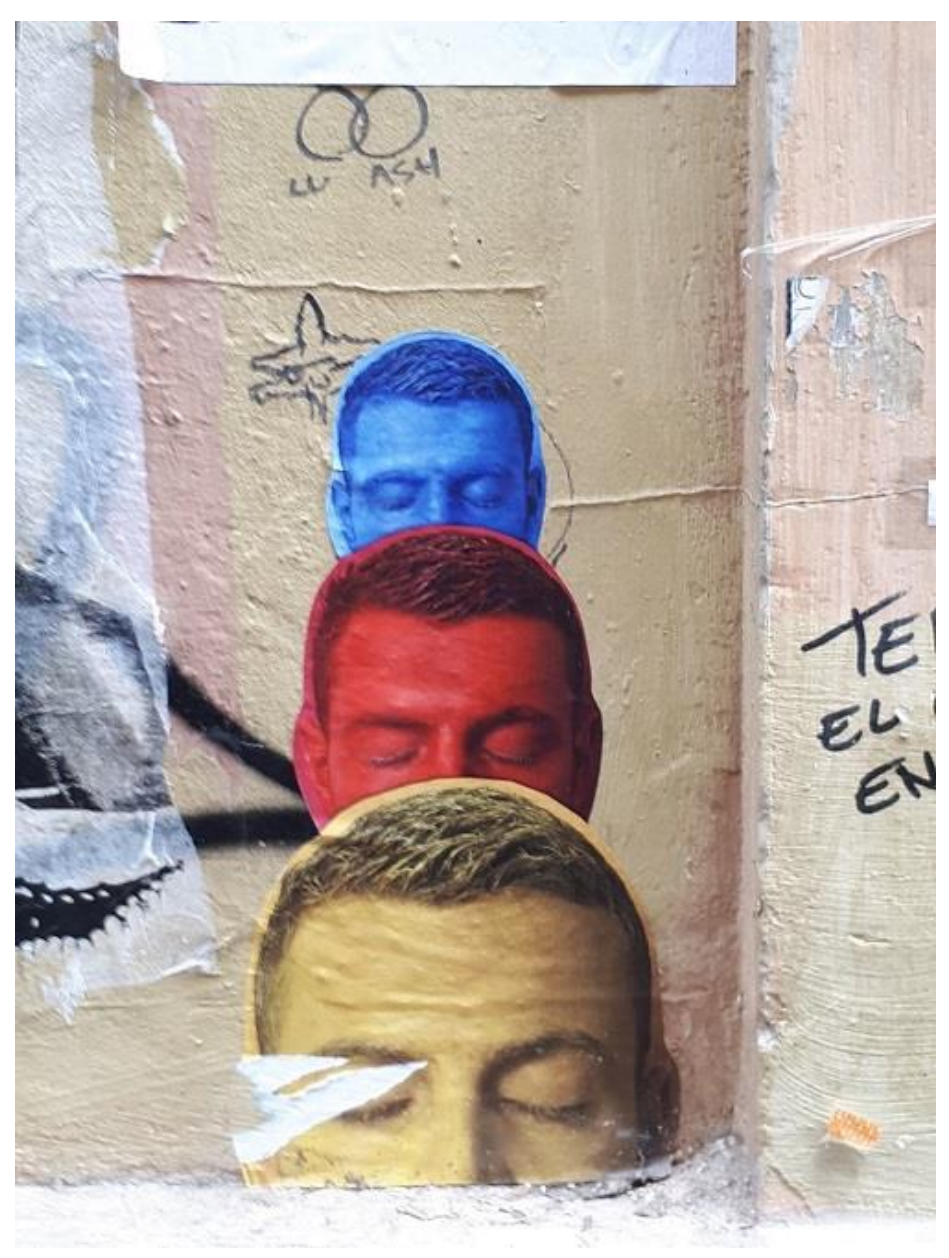
street art in Valencia by unknown artist, February 2023