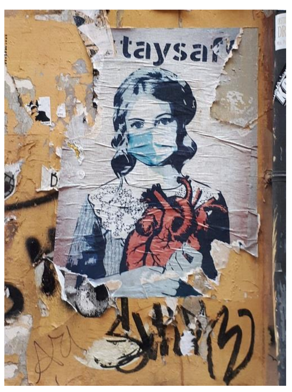
street art in Valencia by unknown artist, February 2023

The presentations of the three countries include a general background and the explanation of the choice of the type of diversity – culture and religion for France; gender and sexual orientation for Italy and mental health for Spain.